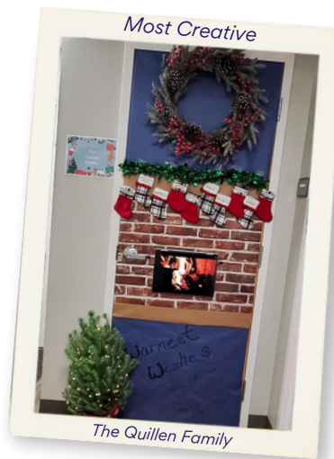
The Quillen Family