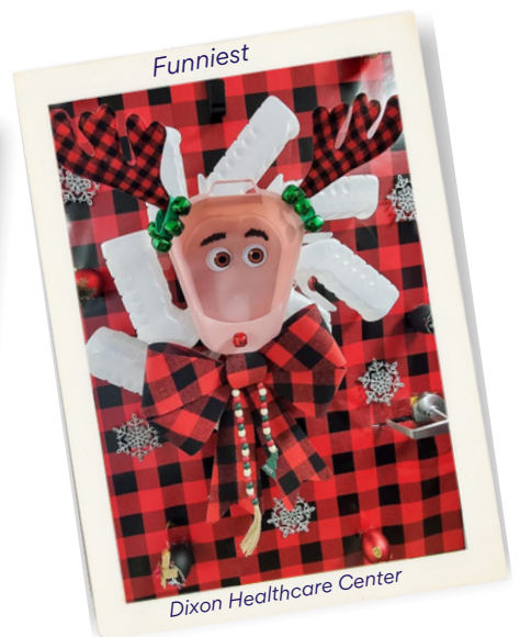
Dixon Healthcare Center