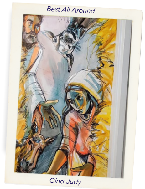
Best All Around